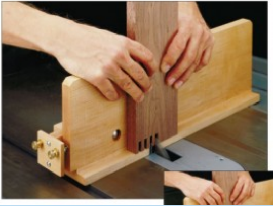
Box Joint Jig

This shop-made jig lets you "dial in" perfect-fitting box joints on your table saw or router table. The unique micro-adjustment system and locking feature make it easy and accurate.